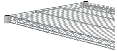
MODEL # 2460CHWF