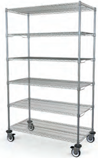
MODEL # MB466CWC-6

*All Kit Models are mobile, have four 4 casters; two (2) swivel/brake, two (2) swivel and a dust cover.