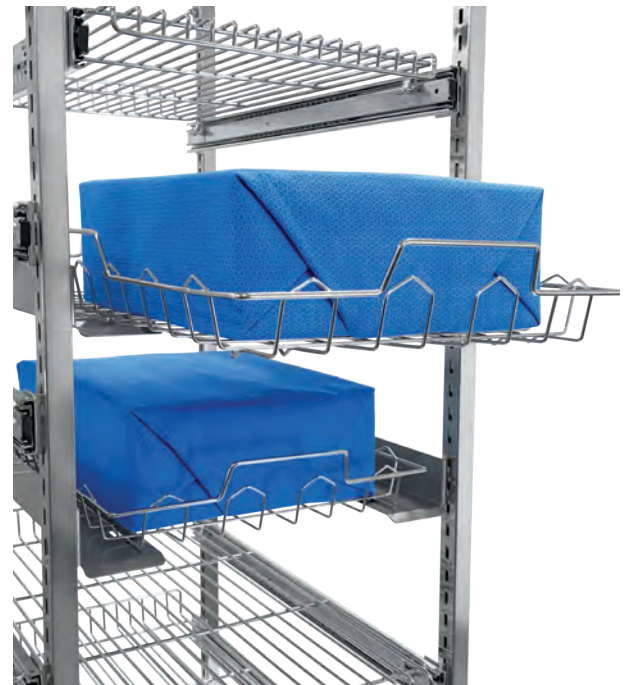
MODEL # SPOT3N

LogiQuip products are covered by a Limited 5-Year Warranty . Visit LogiQuip.com/Warranty for more details.